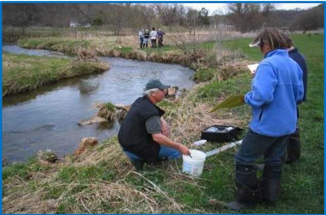
Watershed Restoration and Protection Programs

• Empowering Underserved and EJ Communities—Creation of ‘Pocket Parks’ (Los Angeles, CA)