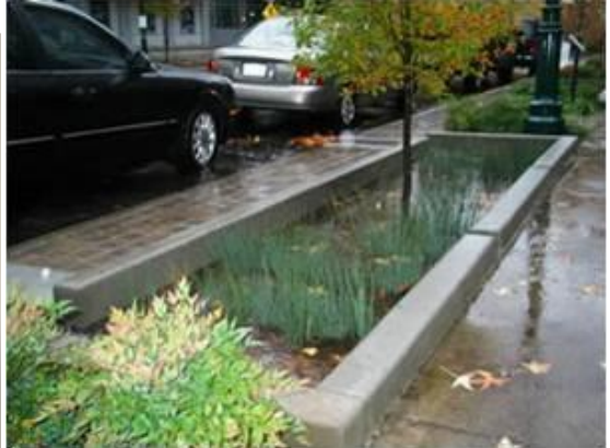
Stormwater management and green infrastructure “Save the Rain” Program— (Onondaga Co., NY)