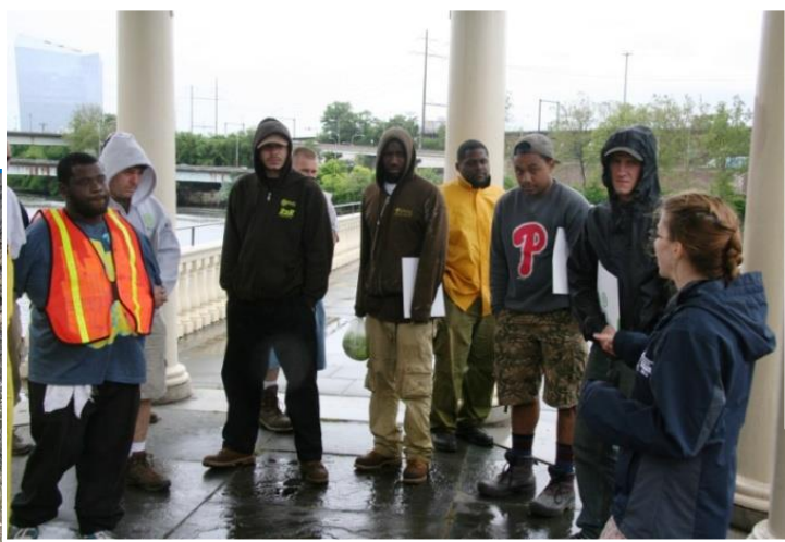
Education and job training